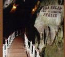
Gua Kelam Recreational Park