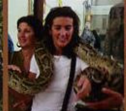
Snake and Reptile Farm